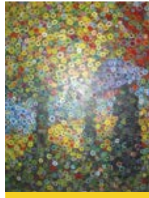
One of the homeowner's favorite paintings provided inspiration for the home's color palette, including the remodel of the master bathroom.

Over the course of the remodel, walls were opened and plumbing was relocated to accommodate the vision for the space. One element that could not be changed without huge expense was the existing beams revealed during construction.