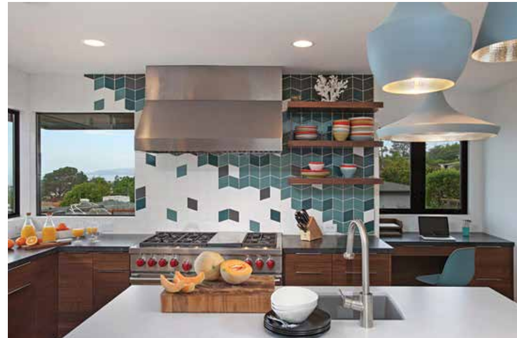
Above: Natural woods, rustic elements, bright white surfaces and an unusual tile design bring an original interpretation to mid-century modern style.