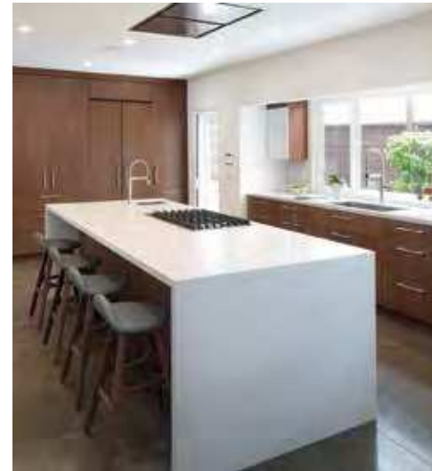
Christie May of Rockwell Interiors designed this sleek waterfall island with plenty of space for cooking and dining.

bathroom or closet, then doing one end is fine. Even then, you may still choose to do the stone on both ends, but you will only see the front-edge profile. I would look at the material quantity and overall budget costs.