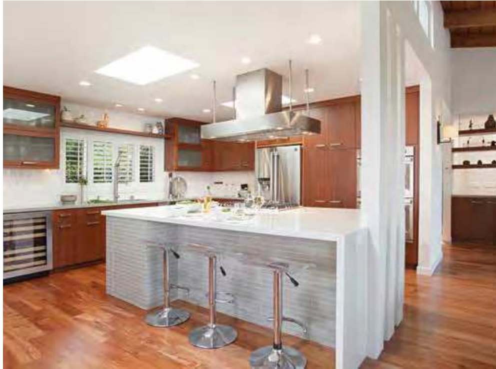
An asymmetrical waterfall island adds a dramatic edge to this light-and-bright kitchen by Tatiana Machado-Rosas of Jackson Design and Remodeling.

Waterfall islands and counters add sleek appeal to any space