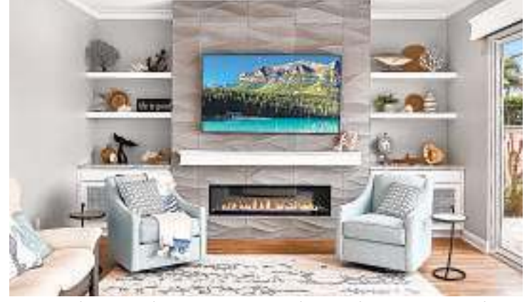
The family room is now more functional with a centered fireplace flanked by shelving and doors connecting to the yard.

But a cockapoo puppy she adopted helped her decide to stay. Hebert went from not know-