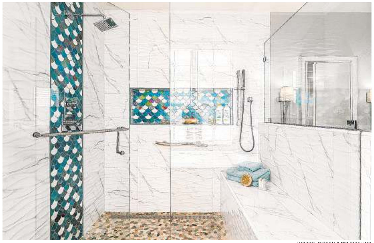
JACKSON DESIGN & REMODELING