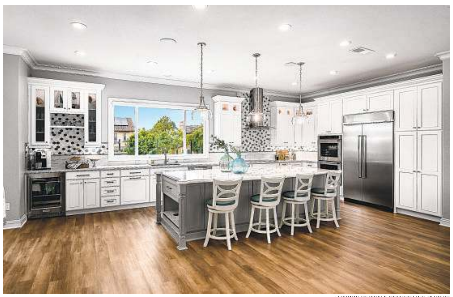
JACKSON DESIGN & REMODELING PHOTOS