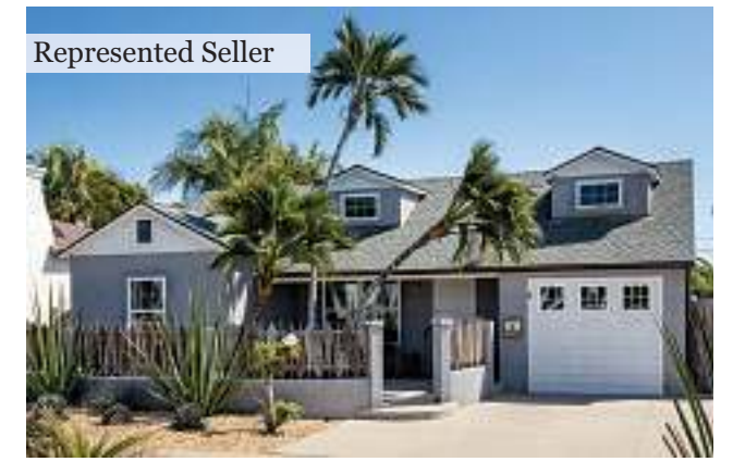
North Pacific Beach