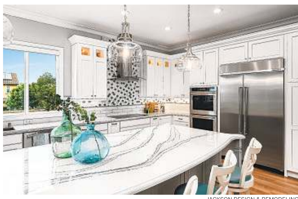
JACKSON DESIGN & REMODELING

A color palette of gray, white and blue creates a light, coastal look in Frankie Hebert's Carlsbad home. The bigger kitchen window allows for sunset views.