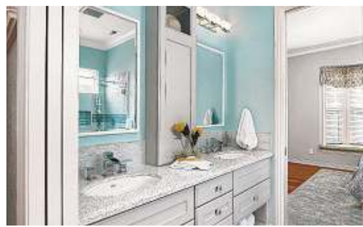
JACKSON DESIGN & REMODELING

The enlarged space allows for a roomy, curbless shower with a partial pony wall covered in glass tile that provides a place to hang toilet paper. More DeWils cabinetry in gray make up the doublesink vanity, topped by a Silestone polished white diamond quartz